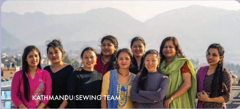
KATHMANDU SEWING TEAM

We're proud to continue our partnership with a Certified Fair Trade company based in Kathmandu, Nepal.