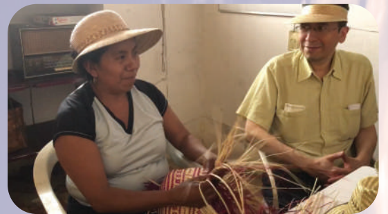
HAND WEAVING IN PROGRESS