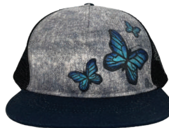
MARIPOSA (flat brim) $22/MSRP $39.99