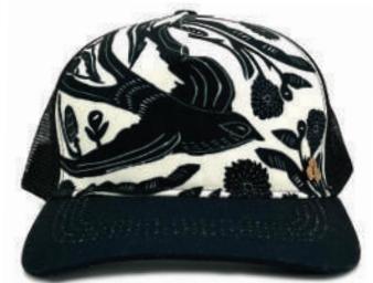
MEADOW (curved brim) $22/MSRP $39.99