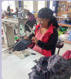
SEWING OUR HATS