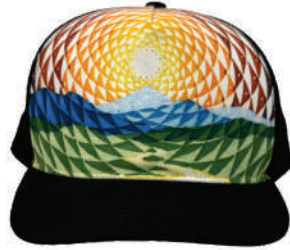
VISTA (curved brim)

70% RECYCLED MATERIALS - MESH BACK- ADJUSTABLE SNAP BACK