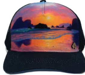
TRINIDAD (curved brim)