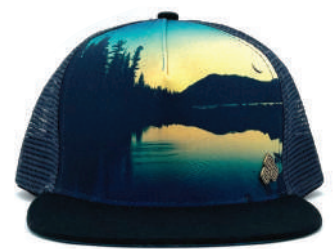
JUNIPER (flat brim)