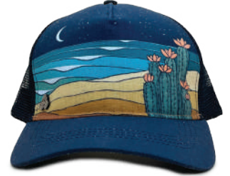
LAND & SEA (curved brim)