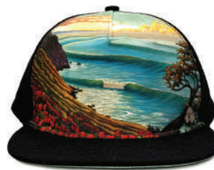
BIG SUR (flat brim)