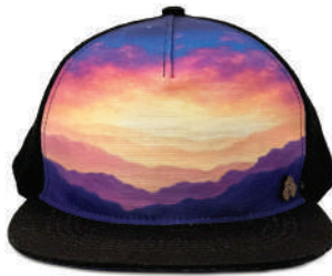
GRATITUDE (flat brim)