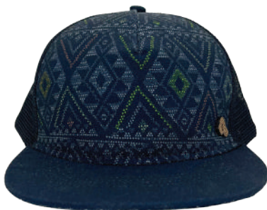
ELECTRO (flat brim) $22/MSRP $39.99