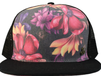
FLORAL (curved brim) $22/MSRP $39.99