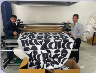
THE PRINTING TEAM

As they continue to improve quality and deepen their impact, we're proud to grow together—producing sustainable headwear that reflects our shared values of love, justice, integrity, and excellence.